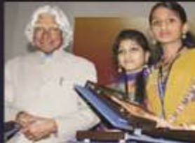
@ IIM, Ahmedabad