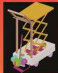
Hi Tech Train Toilet