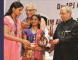
@ IIM, Ahmedabad