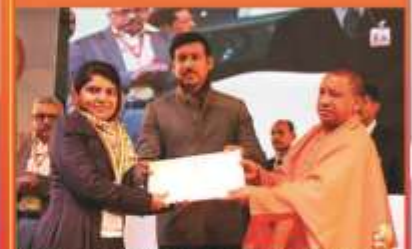
National Youth Award 2015-16 Gautam Buddha University, Greater Noida, New Delhi Cash award Rs. 50,000

Conferred National youth award - 2015-16 for social service (popularisation of science among school students) during the National youth festival 2018 held at Goutam Buddha University, Greater Noda, New Delhi.