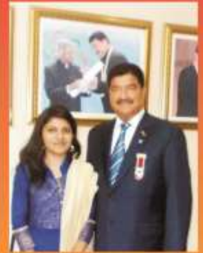
Padmasree Dr. B.R. Shetty Chairman UAE Exchange & New Medical Centre Group