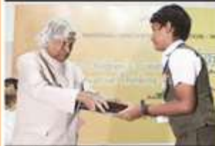
@ IIM, Ahmedabad