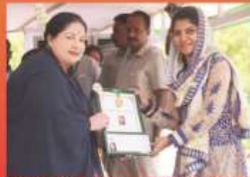
CM's State Youth Award - 2016 St. George Fort - Independence day function A Gold Medal, Certificate & Cash Rs. 50,000

( popularisation of science among school students) during the Independence day function held on 15-08-2016.