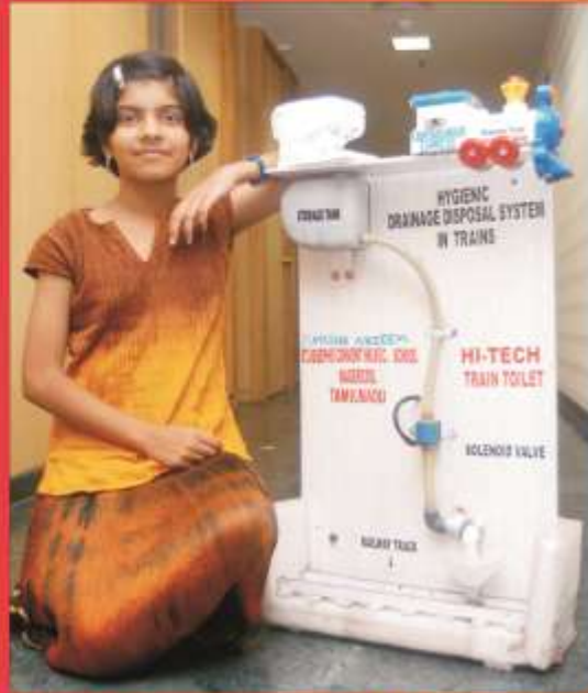
Hi-Tech Train Toilet - Won 1 International and 2 National awards at her age of 12